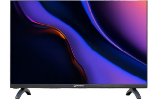
LED TV 32 INCH