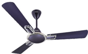
BRANDED CEILING FAN