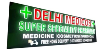
LED MEDICAL LIGHT BOARD WITH NAME