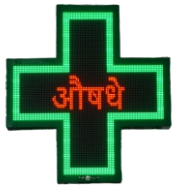
MEDICAL SIGN BOARD